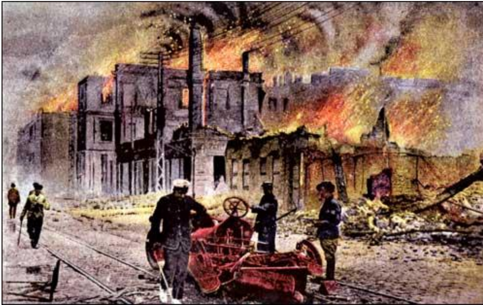
Corner of the Quay, Salonika

In 1917 the town of Salonika was largely destroyed by a huge fire, which seems not to have been related to the conflict.