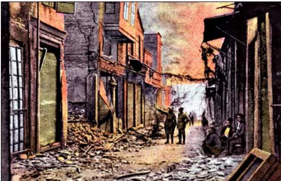
Salonika – Tunsky Street

The Salonika Front remained quite stable, thanks to the combined Allied troops, despite local actions, until the great Allied offensive in September 1918, which resulted in the capitulation of Bulgaria and the liberation of Serbia.